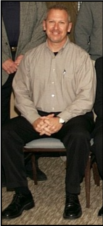
appointment as President