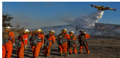
Tick Fire

Registrations have begun to trickle in. A second Square device will be purchased for $10 to speed up the registration process.