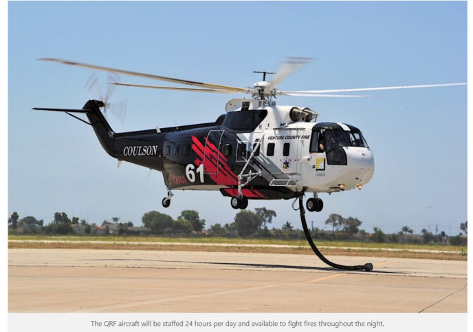
The QRF aircraft will be staffed 24 hours per day and available to fight fires throughout the night.

Each host agency will manage their assigned helicopter as they would their own aircraft. If an agency is experiencing a wildland fire with the potential for rapid spread, then all four helicopters can be mobilized as a QRF to apply maximum force in the early stages of the fire.