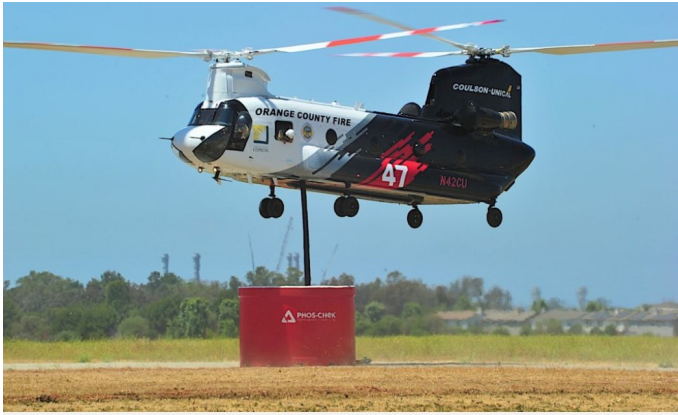
A Quick Reaction Force CH-47D during a press event on June 14.

Local power company Southern California Edison (SCE) provided around $18 million in funding for the QRF aircraft, which are being operated under an exclusive-use contract that started June 15. The contract will run for up to 180 days through the summer and fall, when the ferocious Santa Ana wind events arrive with the ability to cause the fast spread of fires.