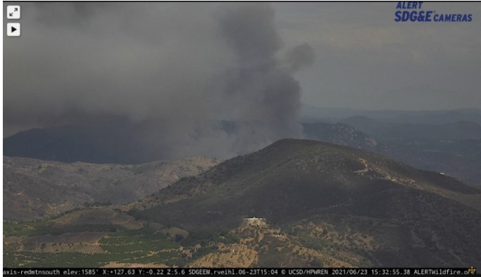
Mesa Fire on Pala Mesa from Red Mountain Camera