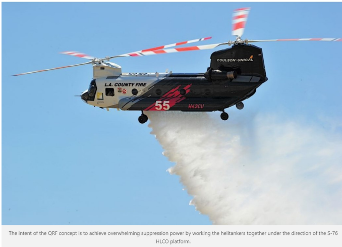
The intent of the QRF concept is to achieve overwhelming suppression power by working the helitankers together under the direction of the S-76 HLCO platform.

The helicopters include two Boeing CH-47D Chinook "very large helitankers" capable of carrying up to 3,000 gallons of water or fire retardant, one Sikorsky S-61N with a 1,000-gallon belly tank, and a Sikorsky S-76 "Firewatch" helicopter for command and control (HLCO) purposes.