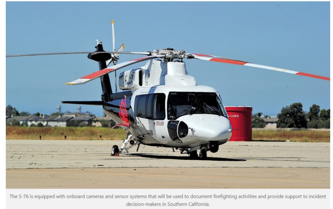
The S-76 is equipped with onboard cameras and sensor systems that will be used to document firefighting activities and provide support to incident decision-makers in Southern California.

All of the aircraft are equipped for flight under night vision goggles (NVGs), enabling them to continue operations at night when favorable temperature and humidity changes tend to slow the spread of fires. Although Southern California agencies have been conducting nighttime aerial firefighting operations for years now, this will be the first time that a helitanker as large as the CH-47 has been used to fight fires after dark.