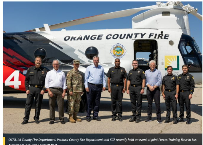
OCFA, LA County Fire Department, Ventura County Fire Department and SCE recently held an event at Joint Forces Training Base in Los Alamitos to debut the aircraft fleet.